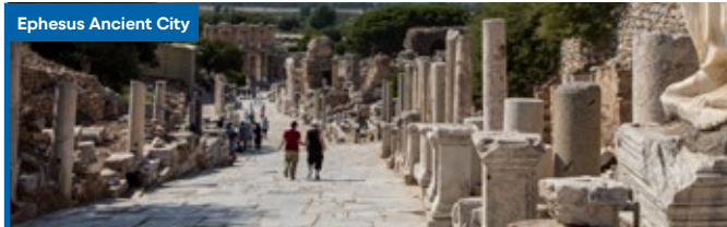
Ephesus Ancient City