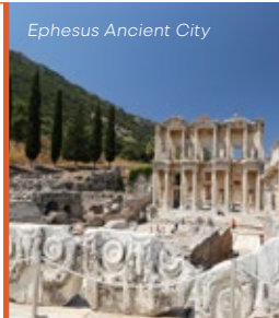
Ephesus Ancient City

The brightest reflections of knowledge, philosophy and the long journey of science were seen in Izmir. The foundation of modern medicine was laid here. The basic pillars of the culture of democracy were built here and spread all over the world from Izmir. The world's first known parliaments, the oldest assemblies where democratic decisions were made and established in this city and in the unique geography that gave life to this city.